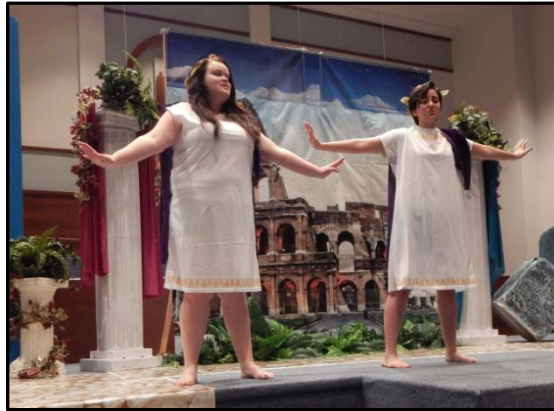
Celebration (Extollo) Time